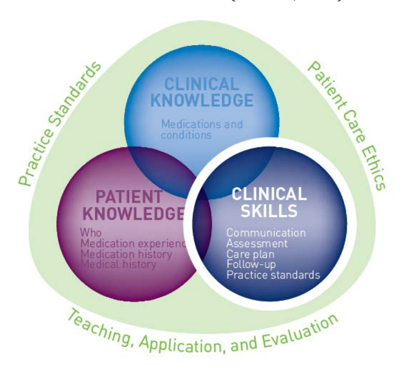
FIGURE 4 PRACTICE COMPETENCY COMPONENTS (LOSINSKI, 2011)

Additionally, the pharmacists in this research described the benefit of leadership and team building training programs. These programs should be encouraged, but would not be recommended as essential prior to participation on the primary health care team. These could be considered ancillary programs that a pharmacist may wish to participate in to build confidence and comfort. However, it may be advantageous to advocate for this type of skill development to be embedded in the team building activities of the primary health care team at each site and could be led by the health region's facilitators.